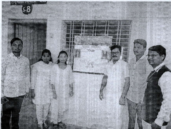
Wall Paper Presentation

N.B. : The individual PBAS Performa duly filled along with all enclosures, submitted for CAS promotions will be verified by the College / Institute / University as necessary and placed before the Screening Cum Evaluation Committee or Selection Committee for Assessment Verification.